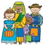
Trunk or Treat Saturday, 10/27

Asbury will host its first "Trunk-or-Treat" Night on Saturday, 10/27, from 6:00 to 8:00 PM. Trunk-or-Treat is an event that offers youth the opportunity to scare or amuse us while they parade from car trunk to car trunk in the church parking lot. Sign up to decorate your car's trunk and give out some treats. Members can also participate by making candy, food, and/or monetary donations. Photo booth, music, and a "Road Kill Cafe" scheduled to be available. More info to follow. Please sign up in the Community Room or contact Lisa at Indiffenbaugh@hometownu.com .